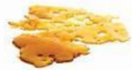
SHATTER A translucent, brittle, & often golden to amber colored concentrate made with a solvent