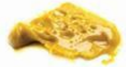
BADDER/BUDDER Concentrates whipped under heat to create a cake-batter like texture