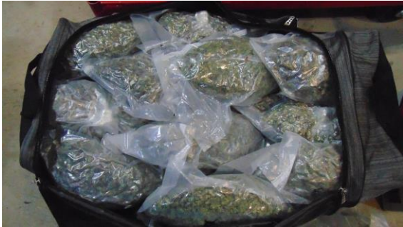
60 POUNDS NEAR BRADSHAW