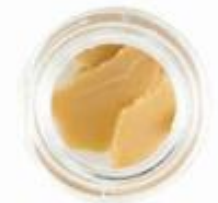
ROSIN End product of cannabis flower being squeezed under heat and pressure