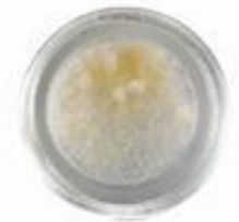
CRYSTALLINE Isolated cannabinoids in their pure crystal structure