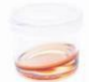
DISTILLATE Refined cannabinoid oil that is typically free of taste, smell & flavor. It is the base of most edibles and vape cartridges