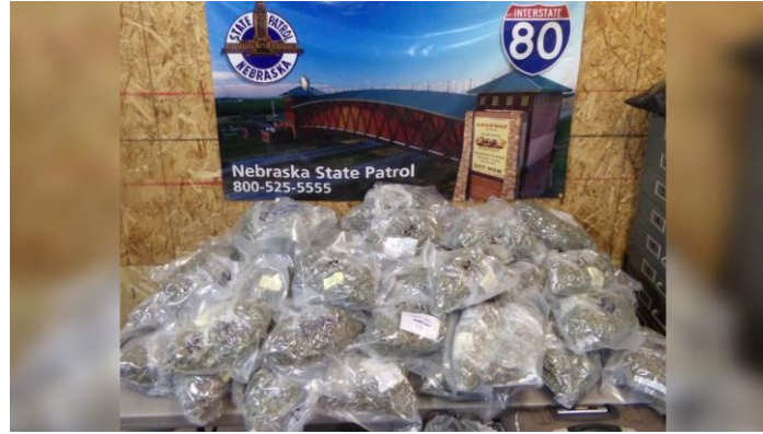
49 POUNDS NEAR KEARNEY