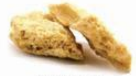
CRUMBLE Dried oil with a honey-comb like consistency