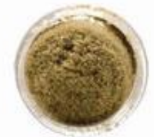
DRY SIFT Ground cannabis filtered with screens leaving behind complete trichome glands. The end-product is also referred to as kief