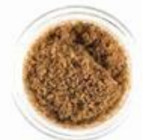
BUBBLE HASH Uses water, ice, and mesh screens to pull out whole trichomes into a paste-like consistency